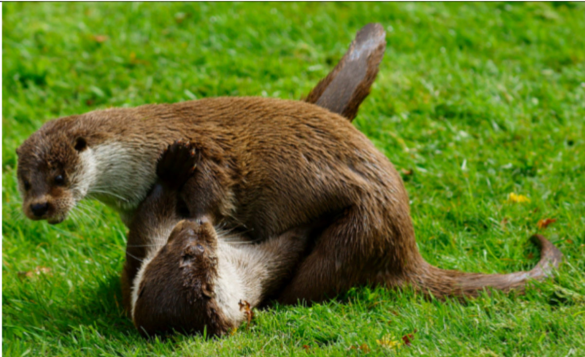
Otters love to play!