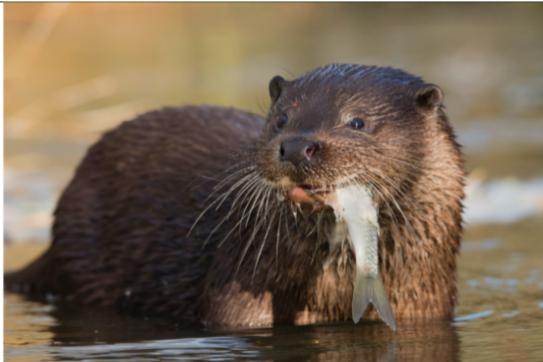
Otters eat lots of fish, as well as shrimp, crawfish, and other aquatic creatures.