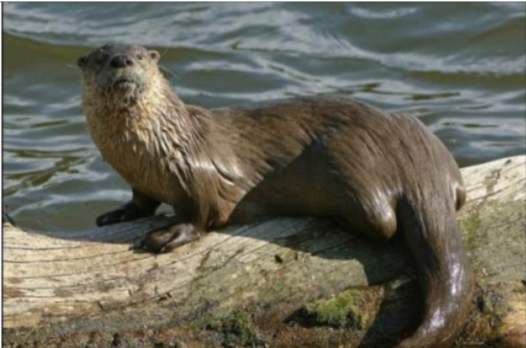
River otters have long slender bodies with short, dense fur. Their eyes, nose, and ears are on the top of their head.