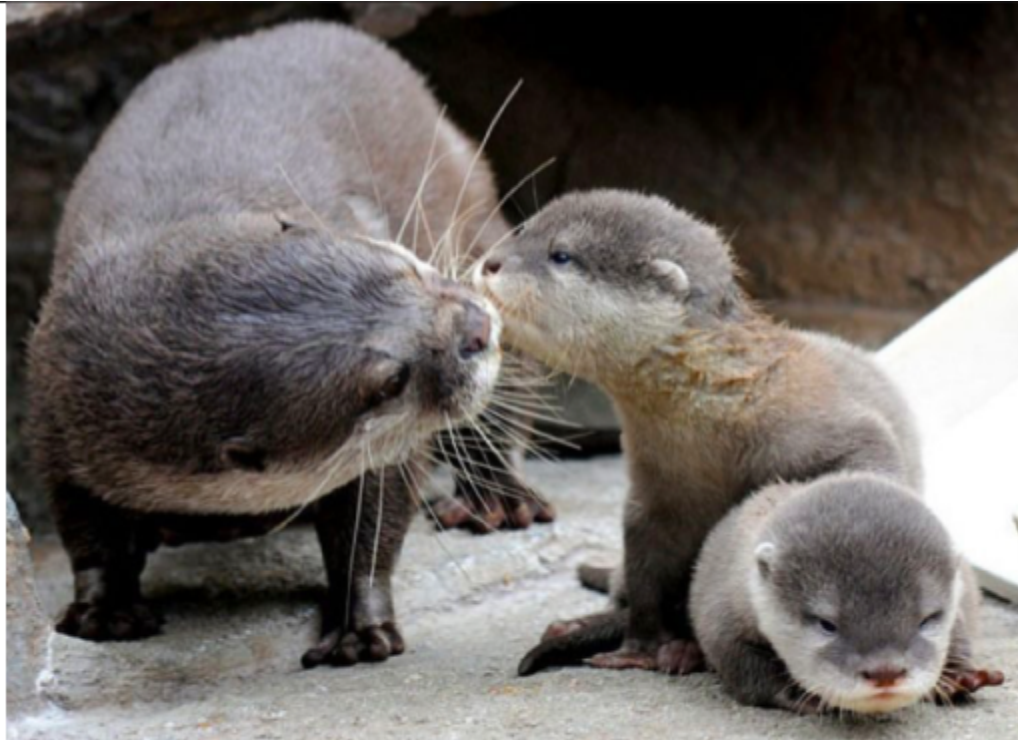
Otter babies are called pups.