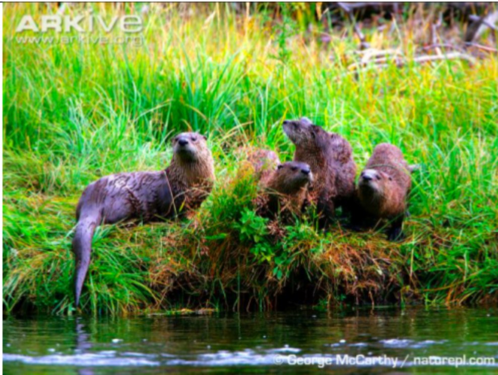
River otters live...in rivers! They are very social and live in groups.