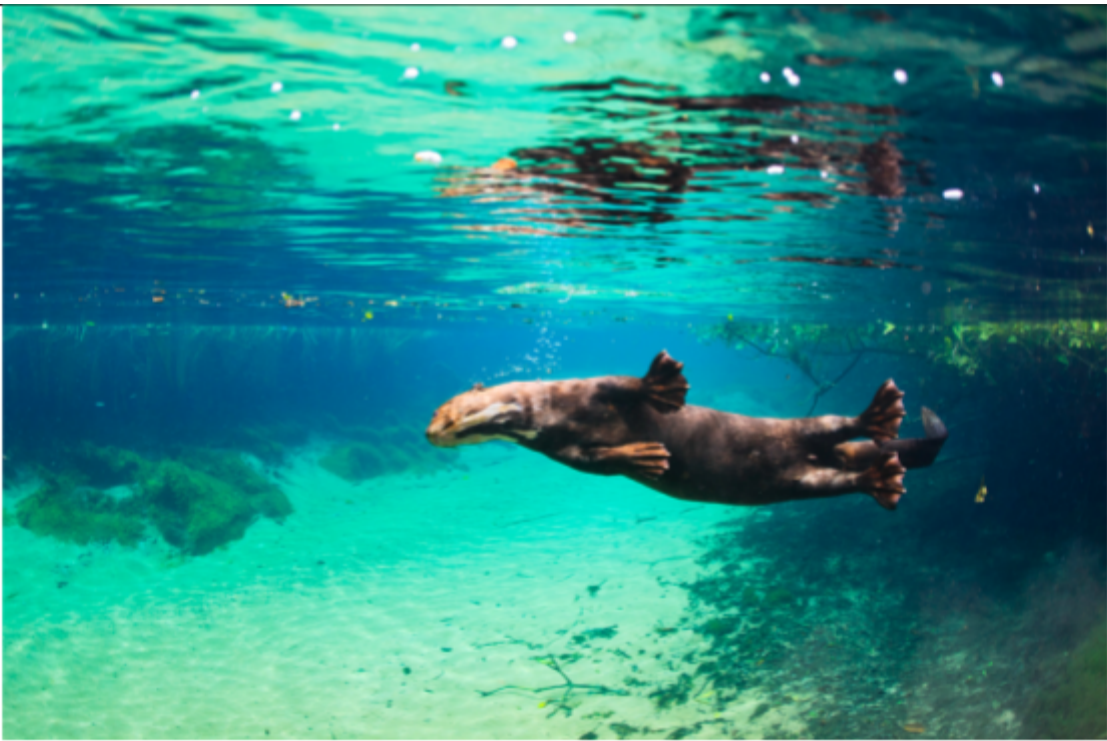
Otters are excellent swimmers.