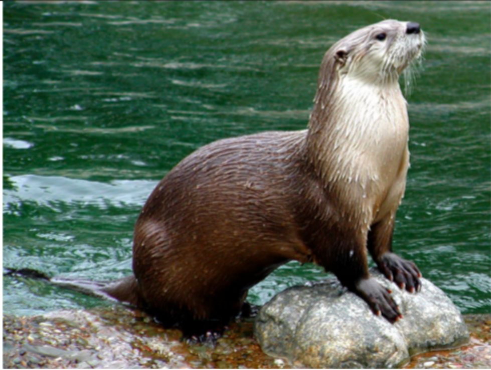
Some otters live in the sea, but most otters live in freshwater. The otters at the Zoo are North American River Otters.